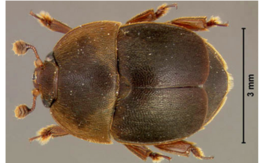
Figure 1. Dorsal view of an adult male small hive beetle, Aethina tumida Murray.